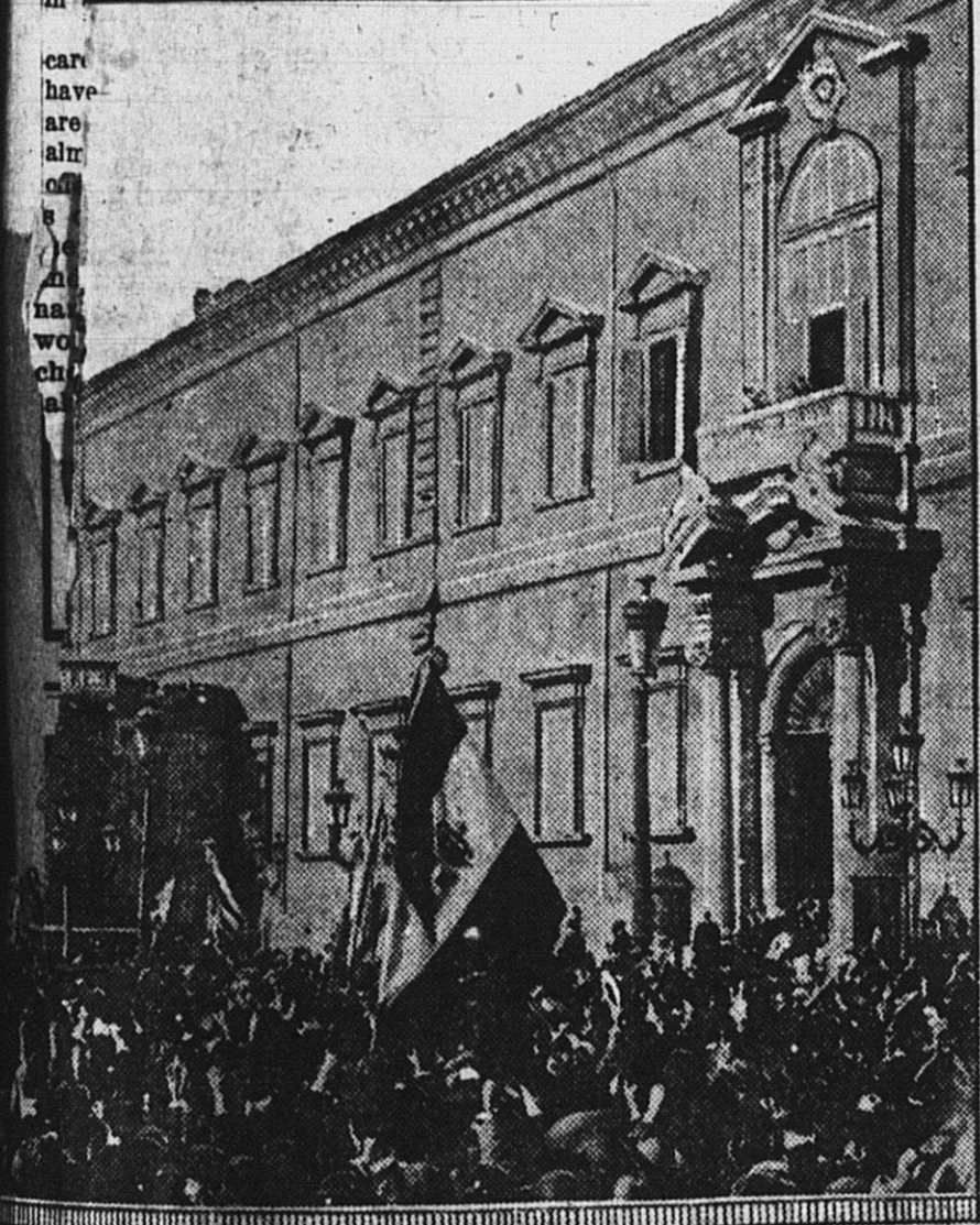
ROYAL PALACE, ROME

Many tourists give these alms, else they would soon mean of maintenance.